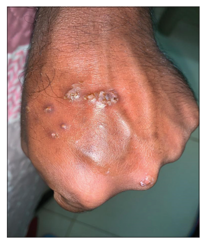
Figure 1: Vesicles and bullae surrounded by a violaceous border on the left dorsal hand.

With the details mentioned above, we considered differential diagnosis of localized neutrophilic dermatosis, insect bite reaction, and secondary pyoderma.