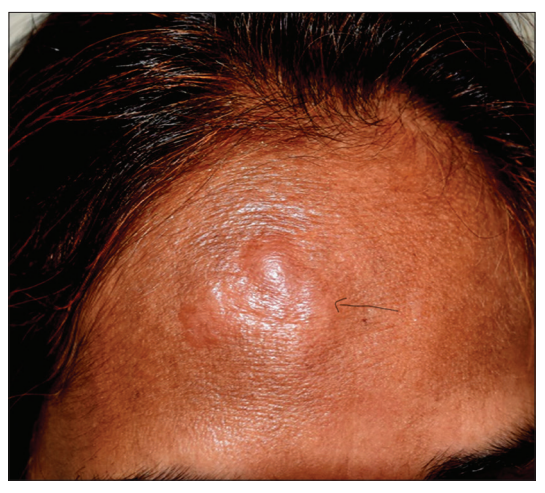
Figure 1: A well-defined, mobile, firm to hard, non-tender nodule of size 2 \times 2 cm on the right side of forehead (black arrow).

Histopathological examination of the forehead swelling showed presence of naked granulomas composed of epithelioid histiocytes and giant cells, in the dermis, which was consistent with sarcoidosis [Figure 3]. The specimen did not show any atypical cells. Wade-Fite stain for acid-fast bacilli and Giemsa stain for fungal elements were negative. Biopsy specimen from the underlying frontal bone showed lymphocyte-poor noncaseating granulomas with occasional fibrosis [Figure 4].