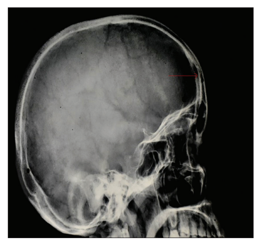
Figure 2: Radiography of skull showing a lytic lesion (red arrow) in the frontal bone.

Mantoux test with five units of purified protein derivative was negative. Serum calcium and angiotensin-converting enzyme levels were within normal limits. Chest radiography showed bilateral pulmonary reticulonodular shadows. High-resolution CT scan of the chest showed subpleural thickening with atelectasis involving lower lobes of both lungs. Ophthalmology evaluation did not show any abnormality. Electrocardiogram and a detailed cardiology evaluation did not show any abnormality.