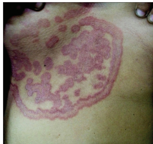
Figure 2: Well-defined, double-margined, annular, and circinate, erythematous plaque of dermatophytosis. Nannizzia gypsea was isolated from the lesion.