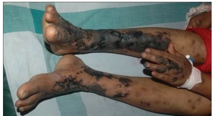
Figure 4: Retiform purpura on legs and gangrene of index finger.