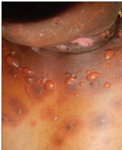
Figure 1: Vesicles and tense bullae of bullous pemphigoid on an erythematous base on trunk.

While in hospital, she developed right-sided wrist drop. Nerve conduction study revealed axonopathy of radial nerve. She was prescribed intravenous dexamethasone at a dose of 1 mg/kg prednisolone equivalent which was later changed to oral prednisolone which was tapered at a dose of 5 mg once a month. Skin lesions subsided and nerve function improved. Histopathology revealed eosinophilic vasculitis with leukocytoclasia and organizing thrombus [Figure 5]. Persistent eosinophilia (2400/dl)