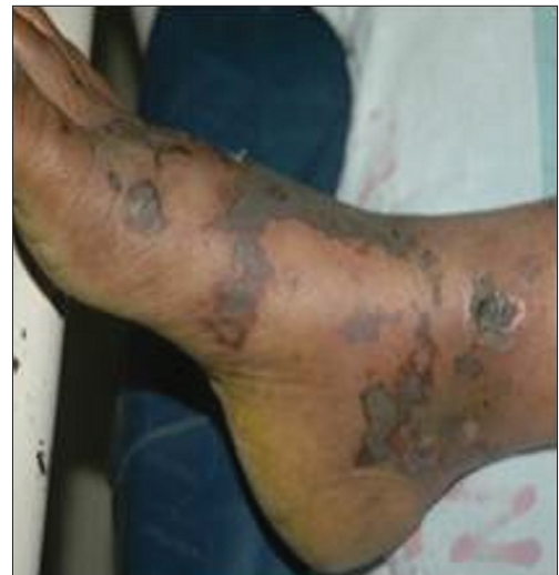
Figure 3: Retiform purpura on foot.