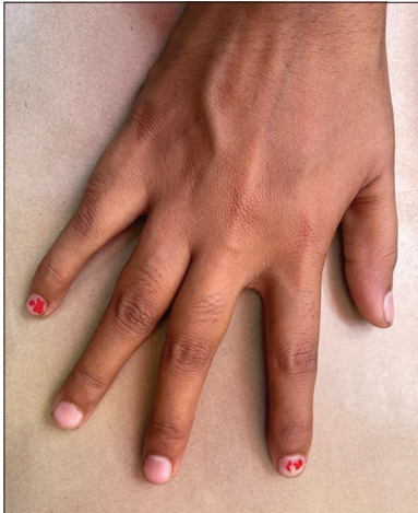
Figure 1 : Enchondromas present over the 3 rd , 4 th , 5 th digits of the right hand.