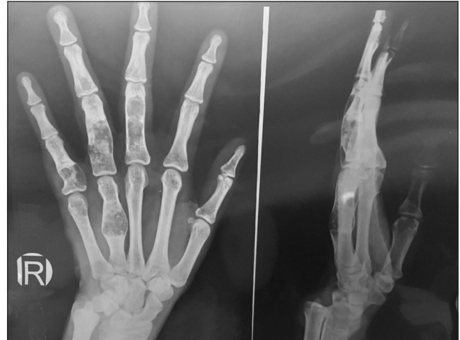
Figure 3: X-ray of the right hand AP and lateral shows multiple well-defined expansile lytic lesions involving metaphysis of 4 th metacarpal, 3 rd and 4 th proximal phalanges, epiphysis of 5 th metacarpal and proximal phalanx. The lesions show type 1a margin with narrow zone of transition. Internal linear and round radiopaque foci are seen, consistent with chondroid internal matrix.

Maffucci syndrome was first defined by Carleton et al. (1942), who named it after the Italian pathologist who described the first affected individual in 1881. [4] IDH1 is a known pathogenic gene in enchondromatosis, and ERC2 is a novel gene identified in Maffucci's syndrome. The somatic L309I mutation of ERC2 contributes to the pathogenesis of hypervascularization to facilitate the development of