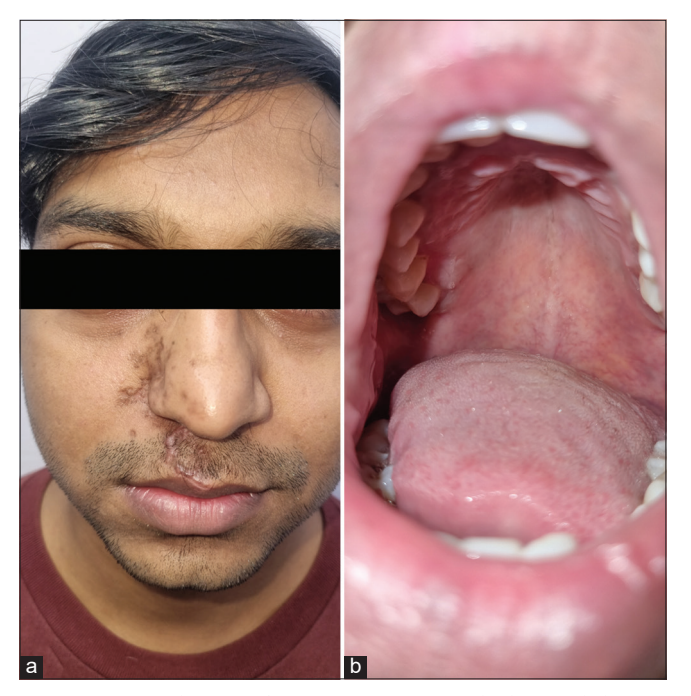
Figure 4: Resolution of (a): Cutaneous and (b): oral lesions following treatment.

lower eyelid edema. Dermoscopy showed brownish crusts with polyglobular structures and background erythema [Figure 2]. Tzanck smear showed many multinucleated giant cells [Figure 3]. The diagnosis of right-sided trigeminal herpes zoster maxillaris was made. He was prescribed oral acyclovir (800 mg 5 times a day) for a week along with diclofenac 50 mg twice daily for pain relief, resulting in complete resolution of the lesions as well as associated symptoms [Figures 4a and b].