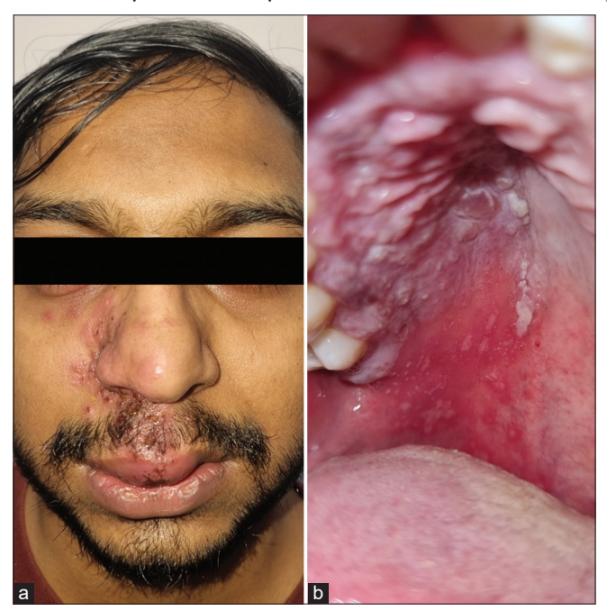
Figure 1 (a): Eroded vesicles on an erythematous base over the right infraorbital area, right nasofacial sulcus, including the tip of the nose, right infranasal area, and right side of the upper lip and (b): Oral cavity showing erosions and grouped vesiculopustules on an erythematous base involving the right half of the palate.

A 25-year-old male presented with a painful vesicular eruption on the right side of his face associated with painful erosions in the oral cavity for two days. The mother recalled him having varicella in his childhood years. He did not have any systemic illness or prior similar episodes. Physical examination revealed eroded vesicles on an erythematous base over the right infraorbital area, right nasofacial sulcus, including the tip of the nose, right infranasal area, and right side of the upper lip [Figure 1a]. Examination of oral cavity showed erosions and grouped vesiculopustules on an erythematous base involving the right side of the palate [Figure 1b]. Examination of eye, nasal cavity and ear were unremarkable, except for mild right