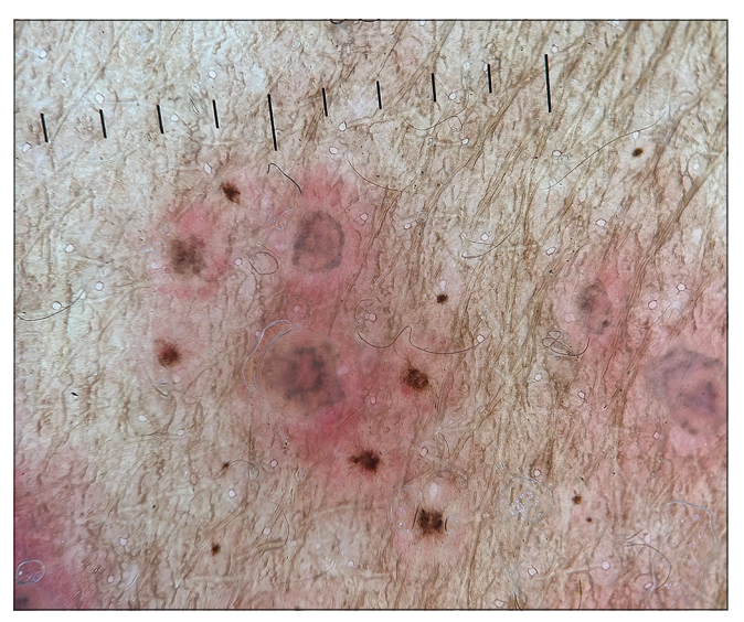
Figure 2: Dermoscopy (Illuco, IDS-1100) showing brownish crusts with polyglobular structures and background erythema (Polarized, \times 20 ).