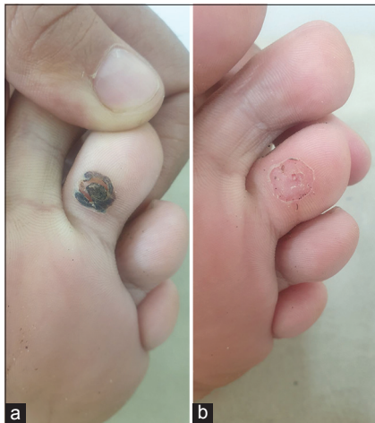
Figure 5: (a) Plantar wart showing Eschar formation post intralesional bleomycin. (b) Complete clearance of wart after paring.