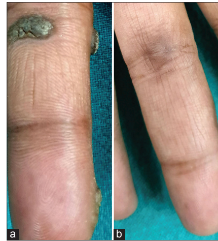
Figure 2: (a) Palmar wart at baseline. (b) At 2 weeks after single sitting of intralesional bleomycin showing complete clearance with residual hyperpigmentation.