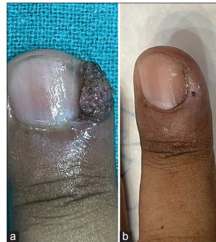
Figure 3: (a) Periungual wart at baseline. (b) Complete clearance at 2 weeks.