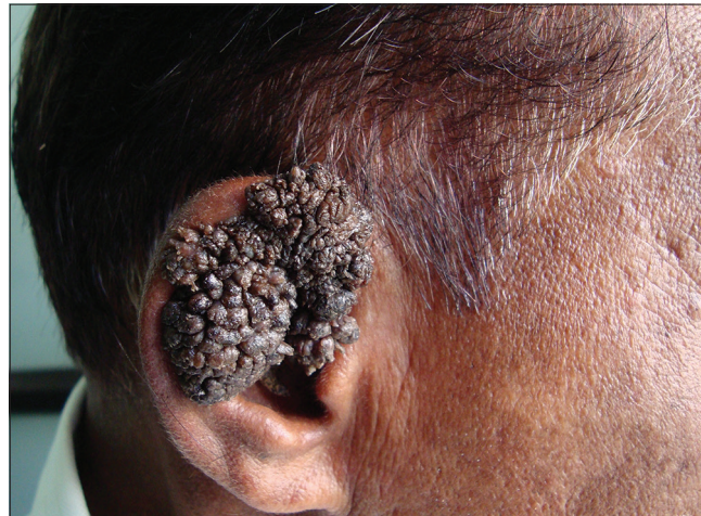
Figure 1: Hyperpigmented plaque with a cerebriform surface and stuck on appearance on the right ear.

This is an open-access article distributed under the terms of the Creative Commons Attribution-Non Commercial-Share Alike 4.0 License, which allows others to remix, transform, and build upon the work non-commercially, as long as the author is credited and the new creations are licensed under the identical terms.