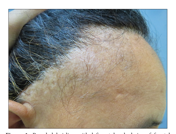
Figure 1: Receded hairline with left out lonely hairs of frontal fibrosing alopecia in a woman. Scarred white areas can be appreciated above the ear denoting the long duration of the disease.

Three clinical patterns of hair loss are described for FFA.[20] They include linear pattern, diffuse pattern, and pseudo-fringe sign pattern. Fringe sign is described in traction alopecia as the retention of some hair along the hairline ahead of the area of alopecia.[37] Similar clinical presentation (frontal and/or temporal unaffected primitive hairline) when observed in FFA is termed as pseudo-fringe sign pattern.[38] In patients who do not show pseudo-fringe