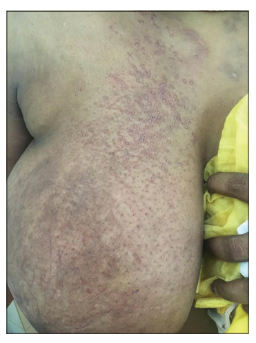
Figure 1: Papulovesicular lesions on upper medial quadrant of the right breast with surrounding erythema.