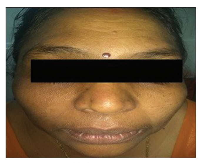
Figure 2: Asymmetry of the face.

parasympathetic neuronal structures, though nonspecific, is widely regarded as the most probable cause. Hypohidrosis or anhidrosis is thought to originate from degeneration of postganglionic projections. Impaired regulation of cutaneous blood flow, leading to dilatation of dermal vasculature, has also been observed. Furthermore, damage to the ciliary ganglion leads to the development of a tonic pupil, while changes in deep tendon reflexes are due to injury to the dorsal root ganglion. This condition has a close overlap with other rare syndromes such as Holmes-Adie syndrome (hyporeflexia with tonic pupil) and Harlequin syndrome (segmental hypohidrosis without pupillary abnormalities).[3]