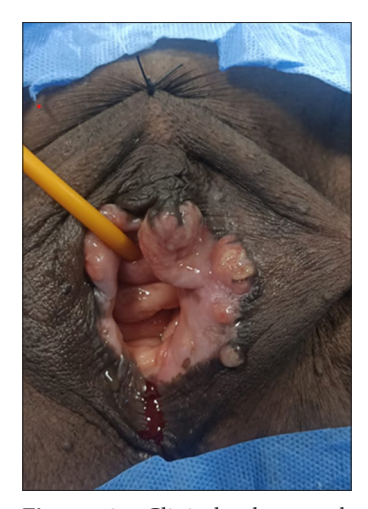
Figure 2: Clinical photograph lesion after applying Lugol's iodine.

Since the lesion was vegetative, we considered a provisional diagnosis of verrucous carcinoma of the vulva with vaginal nodules and squamous cell carcinoma, and a simple vulvectomy was done by sparing the clitoral body. Three specimens were taken: Cervical tissue, posterior vaginal wall tissue, and a simple vulvectomy specimen. Biopsy of the vulva showed partly ulcerated epidermis, irregular acanthosis with pigment incontinence, and dense lymphoplasmacytic infiltrate along with sheets of plasma cells interspersed by congested blood vessels extending up to mid dermis, periadnexal, and perivascular areas. There were sheets of plasma cells interspersed with congested blood vessels without evidence of dysplasia, suggesting PCV [Figure 3]. A cervical tissue biopsy showed chronic cervicitis [Figure 4]. The follow-up period was uneventful and the patient is asymptomatic till now.