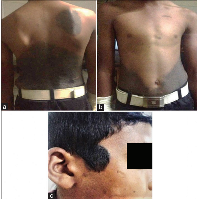
Figure 1: (a) Giant melanocytic nevus reaching up to scapulae on the back. Another circumscribed lesion on the (r) scapular region. (b) Melanocytic nevus extending to the lower abdomen and a few small nevi on the anterior chest. (c) A circumscribed melanocytic nevus in the right temporal region.