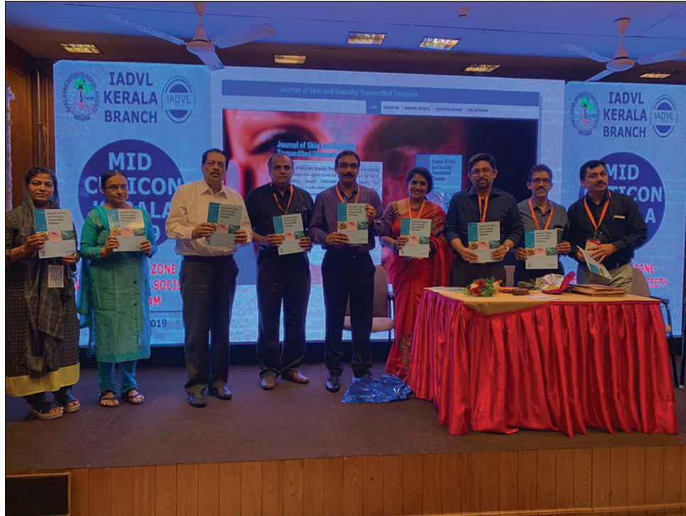
Figure 5: Launch event of Journal of Skin and Sexually Transmitted Diseases (JSSTD).