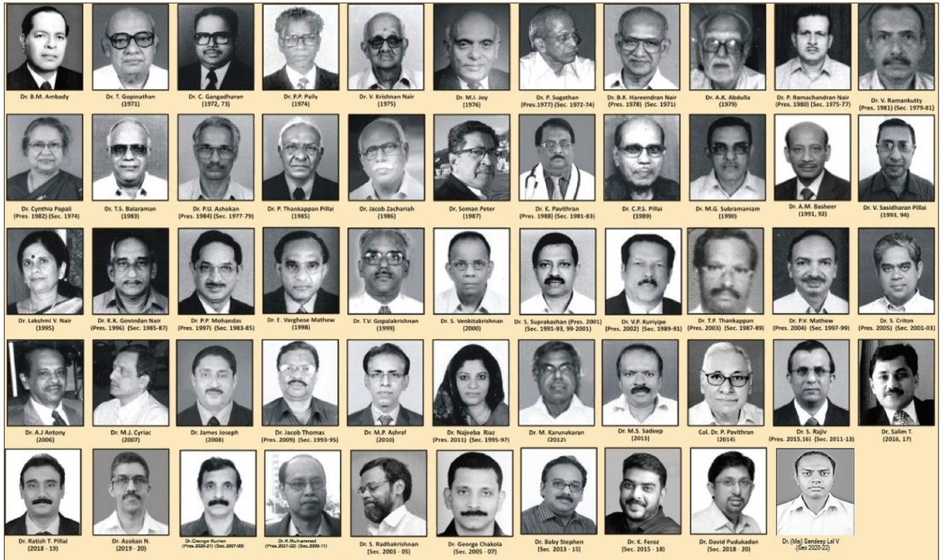
Figure 3: Office bearers of Indian Association of Dermatologists, Venereologists, and Leprologists (IADVL) Kerala.