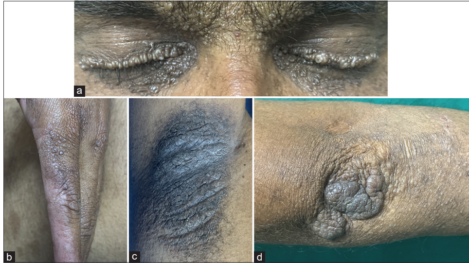
Figure 1: (a): Beaded papules over eyelids suggestive of moniliform blepharosis; (b): Beaded skin-colored papules over the sides of fingers; (c): Verrucous plaque over axilla; (d): Verrucous plaque over the elbow.