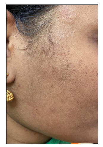
Figure 5: After 10 sessions of psoralen and ultraviolet-A treatment.