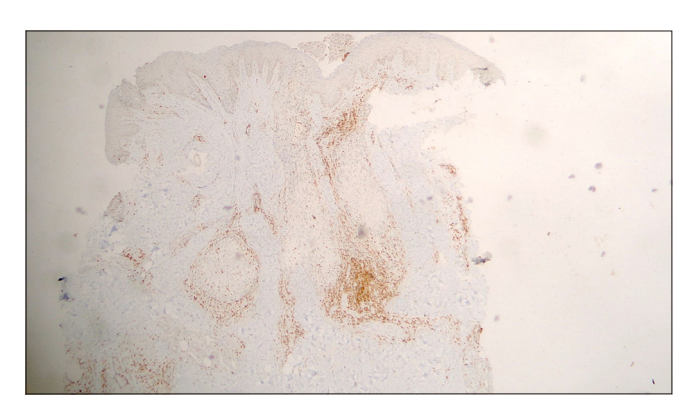
Figure 3: Immunohistochemistry showing CD 3 positivity (×10 magnification).