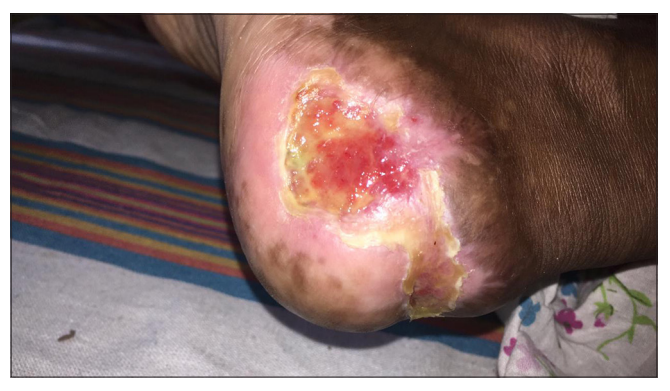
Figure 5: Healing wound on left heel at eight weeks.