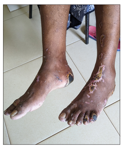
Figure 4: Skin lesions at three weeks after presentation showing necrotic areas.

Although we were unable to identify any in our case, usual risk factors for developing IMD are young age, living in crowded households or communal settings, weakened immunity, lack of spleen, recent respiratory infection, smoking, genetic susceptibility, travel to high-risk areas, and certain occupations with high risk of exposure like laboratory handlers.<sup>[7]</sup>