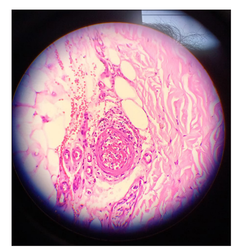
Figure 3: Skin biopsy showing thrombi in vessels and neutrophilic vasculitis. hematoxylin and eosin \times 10 .

All the healthcare staff who handled the patient and her close contacts were given oral ciprofloxacin as prophylaxis. Her condition was notified to relevant authorities according to local protocol.