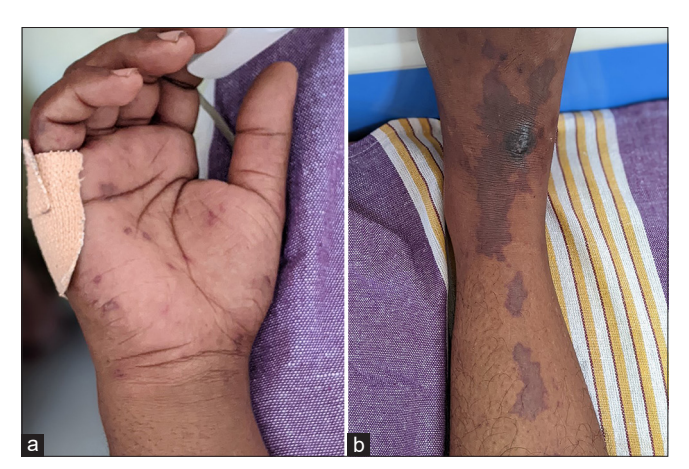
Figure 1: (a-b) Skin on the second day of the illness, including petechial, ecchymotic, and purpuric lesions.

The punch skin biopsy from the edge of a developing lesion over the right foot demonstrated neutrophilic vasculitis