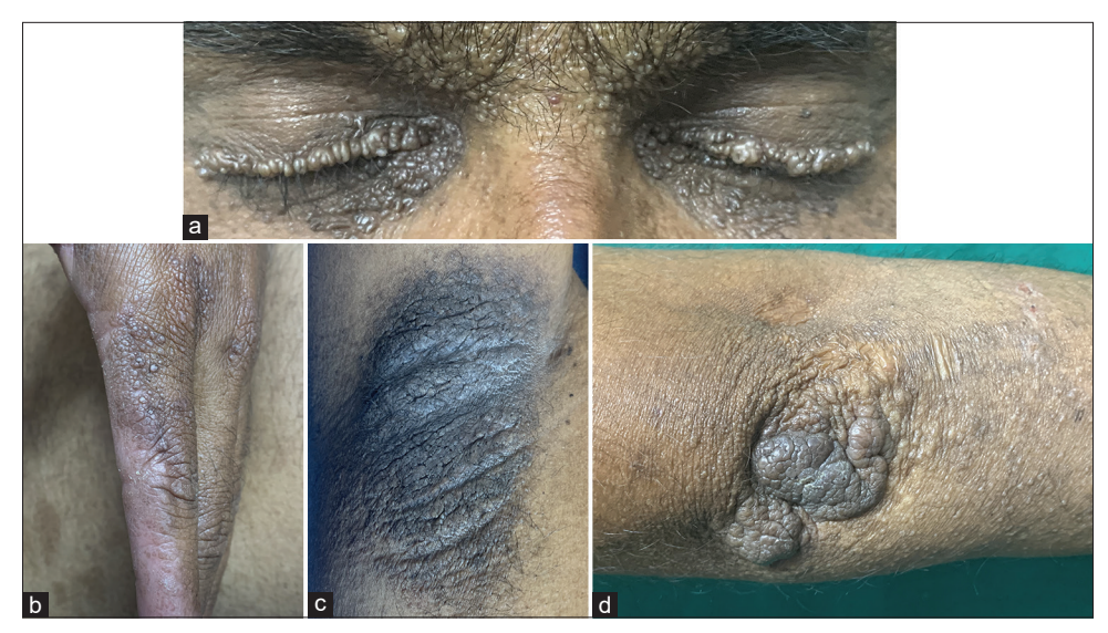
Figure 1 (a): Beaded papules over eyelids suggestive of moniliform blepharosis; (b): Beaded skincolored papules over the sides of fingers; (c): Verrucous plaque over axilla; (d): Verrucous plaque over the elbow.