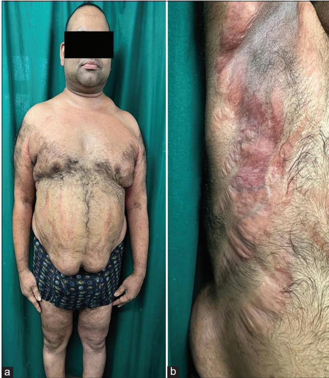
Figure 1 (a): Clinical image of the patient showing moon-like face, truncal obesity; and (b): multiple striae rubrae.

On physical examination, he had a moon-like face and central obesity with a body mass index of 32.79 kg/m 2 [Figure 1]. His blood pressure readings were consistently above 150/100 mmHg. Cutaneous examination revealed multiple striae rubra over the axilla, groin, and trunk, a few acneiform eruptions, and ill-defined erythematous scaly papules and plaques. Dermoscopic examination showed diffuse erythema, peripheral white scales, and serpentine branching vessels [Figure 2]. A potassium hydroxide mount demonstrated fungal filaments, confirming dermatophytosis. Further evaluation revealed abnormal fasting blood glucose levels at 225 mg/dL (70–99), elevated triglycerides at 200 mg/dL (<150), and a low 6 a.m. serum cortisol level of 22.4 nmoL/L (123–626). Due to financial constraints, the adrenocorticotropic hormone stimulation test could not be conducted. The patient was diagnosed with exogenous Cushing's syndrome (CS), hypothalamic-pituitary-adrenal (HPA) axis suppression, and metabolic syndrome. A detailed ophthalmological evaluation also diagnosed steroid-induced cataract.