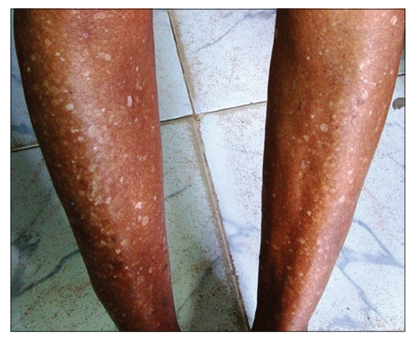
Figure 1: Hypopigmented macules of idiopathic guttate hypomelanosis in the lower limbs.