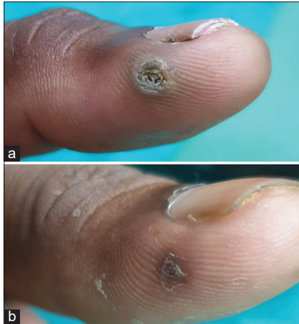
Figure 4 (a): Palmar wart at baseline; (b): Near complete clearance after two sittings of intralesional bleomycin.