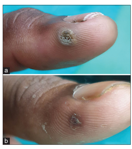
Figure 4: (a and b) on the Bottom left corner but the comment section is not allowing to do so. Kindly check and let me know what needs to be done for that. Also, Pdf edit option is also password protected.