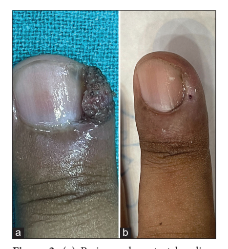
Figure 3: (a) Periungual wart at baseline. (b) Complete clearance at 2 weeks.