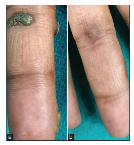
Figure 2: (a) Palmar wart at baseline. (b) At 2 weeks after single sitting of intralesional bleomycin showing complete clearance with residual hyperpigmentation.