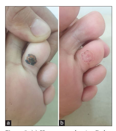
Figure 5: (a) Plantar wart showing Eschar formation post intralesional bleomycin. (b) Complete clearance of wart after paring.