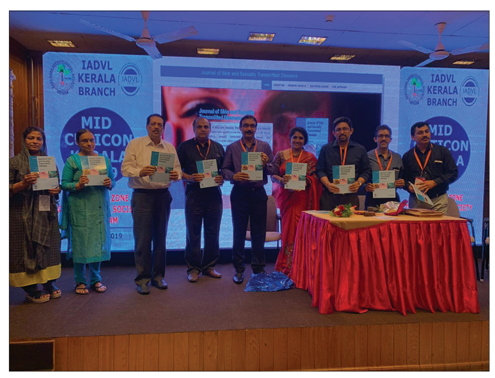
Figure 5: Launch event of Journal of Skin and Sexually Transmitted Diseases (JSSTD).