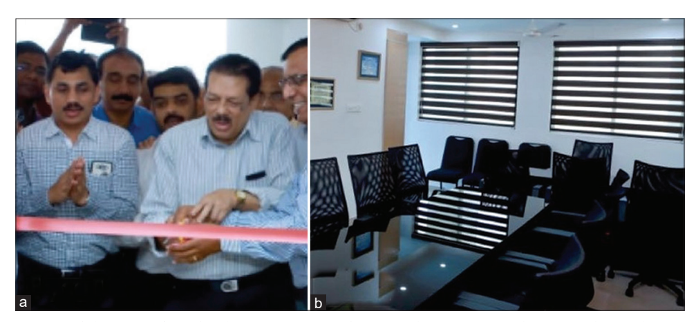
Figure 6: (a) Inauguration of the new office of Indian Association of Dermatologists, Venereologists, and Leprologists (IADVL) Kerala at IMA (Indian Medical Association) House, Kochi; (b): new office of Indian Association of Dermatologists, Venereologists, and Leprologists (IADVL) Kerala.

plays are conducted. Write-ups and interviews in print and visual media are regular features every year.[3]