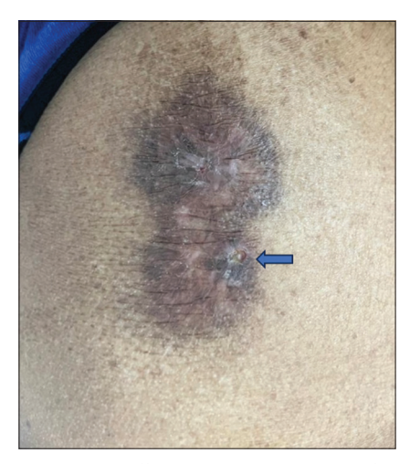
Figure 4: Follow-up picture at 2 weeks, which shows reduced erythema and hyperpigmentation. Skin biopsy (arrow).

even to meatal stenosis. Involvement of the prepuce is called posthitis xerotica obliterans, and involvement of the glans penis is termed balanitis xerotica obliterans.[3]