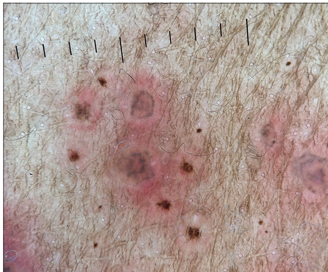
Figure 2: Dermoscopy (Illuco, IDS-1100) showing brownish crusts with polyglobular structures and background erythema (Polarized, \times 20 ).