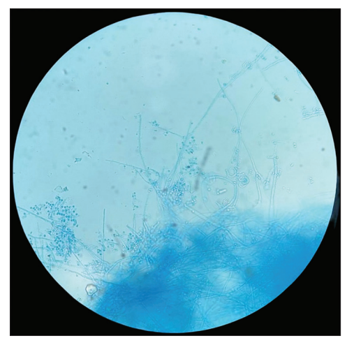
Figure 2: Lactophenol cotton blue tease mount showing microconidia, macroconidia, and spiral hyphae (×100).

This is an open-access article distributed under the terms of the Creative Commons Attribution-Non Commercial-Share Alike 4.0 License, which allows others to remix, transform, and build upon the work non-commercially, as long as the author is credited and the new creations are licensed under the identical terms. ©2024 Published by Scientific Scholar on behalf of Journal of Skin and Sexually Transmitted Diseases