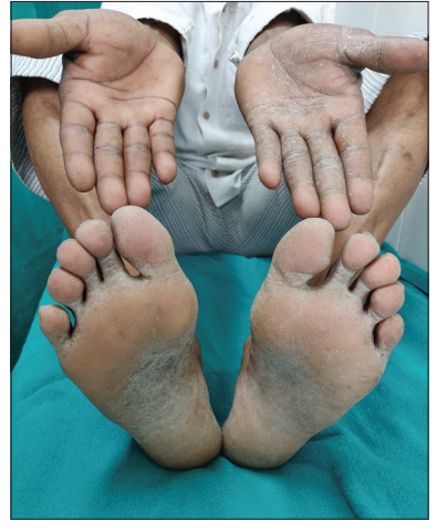
Figure 1: Ill-defined, dry, scaly plaques on the plantar aspect of both feet and the palmar aspect of the left hand.

A 45-year-old male farmer presented with complaints of itchy lesions on both feet and his left hand for 6 months and 1 month, respectively. The lesions first appeared on his feet and later spread to his hand. Itching was present on both feet, and he often used his left hand to scratch them. Physical examination revealed ill-defined, dry, scaly plaques on the plantar aspect of both feet and the palmar aspect of the left hand [Figure 1], without involvement of finger or toenails. Skin scrapings were obtained by scraping the edge of the lesions on both feet and the left hand with differentials of dermatophytosis and dermatitis. Mycological examination with a 10% potassium hydroxide (KOH) mount of scales revealed thin septate hyphae on direct microscopy from all sites. The culture was performed on Sabouraud dextrose agar (SDA) with 0.05 mg/mL chloramphenicol and 0.5 mg/mL cycloheximide and incubated at 28°C in a Biochemical Oxygen Demand incubator. The culture was examined thrice weekly for the appearance of growth. Fungal growth was observed at 3 weeks and was identified by colony morphology followed by microscopic examination using the tease mount technique in a lactophenol cotton blue (LPCB) mount. The LPCB mount showed microconidia, macroconidia, and spiral hyphae [Figure 2]. The culture on SDA was subjected to DNA extraction using a commercially