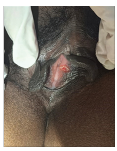
Figure 1: A single ulcer of size ~1 × 1 cm on left labia minora with regular edges, erythematous base, and yellowish necrotic debris