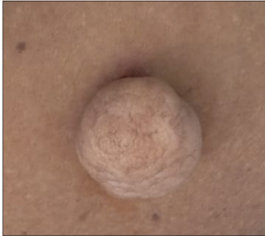
Figure 1: Skin colored soft, pedunculated mass of solitary nevus lipomatosus superficialis.