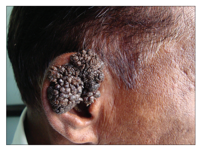
Figure 1: Hyperpigmented plaque with a cerebriform surface and stuck on appearance on the right ear.

A 57-year-old-man presented with a hyperpigmented lesion on the right external auditory meatus of 9 months duration. The lesion first started on the external auditory meatus as a small, pigmented papule and then grew in size over a period of months. The lesion was asymptomatic. On examination, there was a well-defined, hyperpigmented plaque with a cerebriform surface and stuck on appearance, extending from the external auditory meatus to the helix of the right ear [Figure 1]. The plastic surgeons did an excision biopsy, which showed hyperkeratosis, keratotic plugging, massive irregular acanthosis, and horn cysts in the epidermis, diagnostic of seborrheic