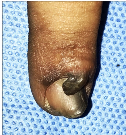
Figure 1: Clinical image showing a separate, curved, nail-like keratin plate adjacent to the right index fingernail.

Ectopic nail (onychoheterotopia) is a rare entity, with fewer than 100 cases reported in the literature. [1] It may be congenital or acquired following traumatic implantation of nail matrix cells. Surgical excision of the ectopic matrix is the definitive treatment. [2] Recognition of this benign condition prevents misdiagnosis as onychomatricoma or cutaneous horn.