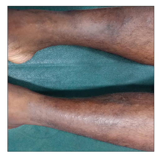
Figure 1: Grade 3 dermatitis curuis pustolsa et atrophicans showing marked alopecia, dryness, papules, and scattered pustules.

Folliculocentric inflammation and the composition of the inflammatory infiltrate, as noted by us, were consistent with the literature.<sup>[1,4-6]</sup> Giant cells were not seen in any of the specimens.